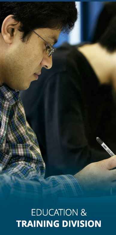
EDUCATION & TRAINING DIVISION