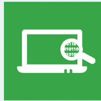
COMPUTER (HARDWARE & SOFTWARE) DIVISION