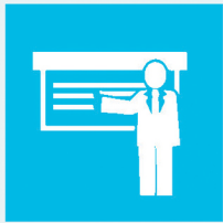
EDUCATION & TRAINING DIVISION

UPDESCO is a multi disciplinary consultancy organisation providing systems back-up to Governments, Enterprises, International organisations and other non-governmental agencies in diagnosing and estimating the magnitude of problems, identifying technological and other alternatives and suggesting methods of improvement.