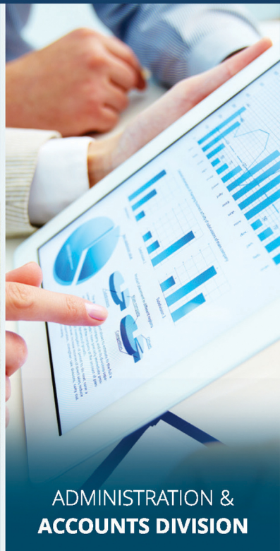
ADMINISTRATION & ACCOUNTS DIVISION