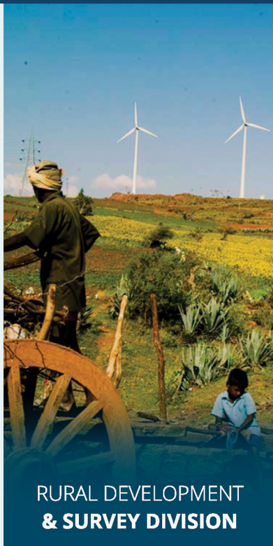
RURAL DEVELOPMENT & SURVEY DIVISION